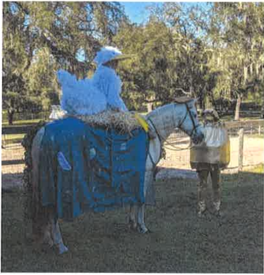
Jack galloped up the beanstalk and stole the Goose who laid the Golden Egg