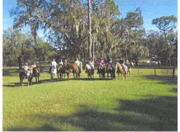
Saturday morning group ready for the trail