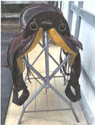
“ Gaits of Gold” four beat saddle, 16 inch