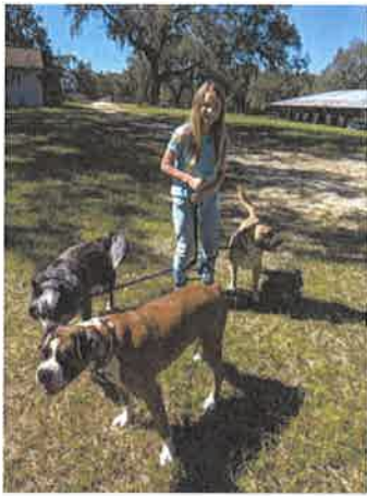
Cali tangled up in leashes. We can see who is walking who!