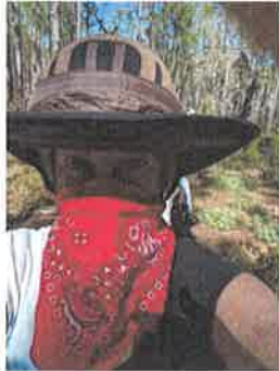
A little Dusty?