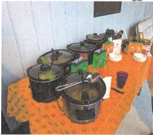
Crock pot deliciousness!