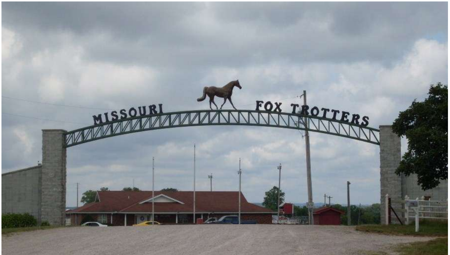
The Home of the Missouri Fox Trotting Horse Breed Association (MFTHBA) Located in Ava, Missouri